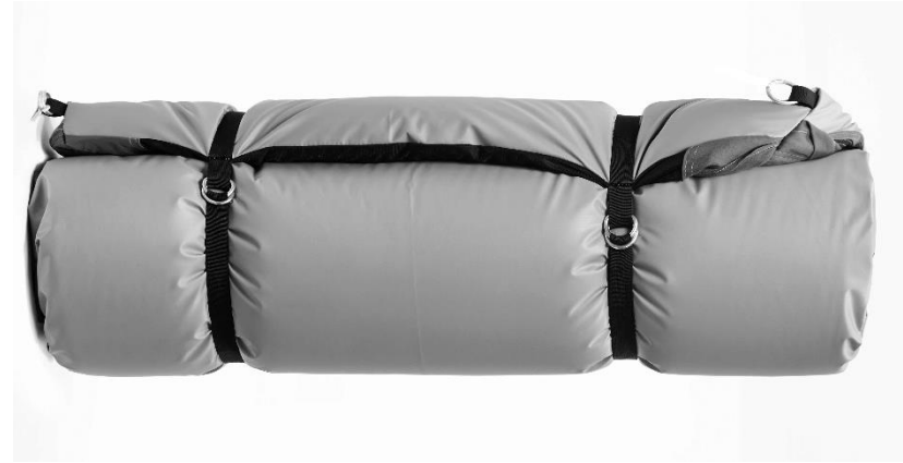
Tip for zippered storage bag: Rather than lifting the rolled tent into the storage bag, place the storage bag over the rolled tent, and then flip it over so zipper is upright, then zip.

3) Roll the tent from head to foot. Use the cinch straps at the foot to secure the rolled swag. Tip: No need to remove your blanket or sleeping bag. Just roll it up inside the swag. The straps are oversized for this purpose. For long term storage, don't leave the cinch straps too tight or you may get some permanent compression on the mattress pad.