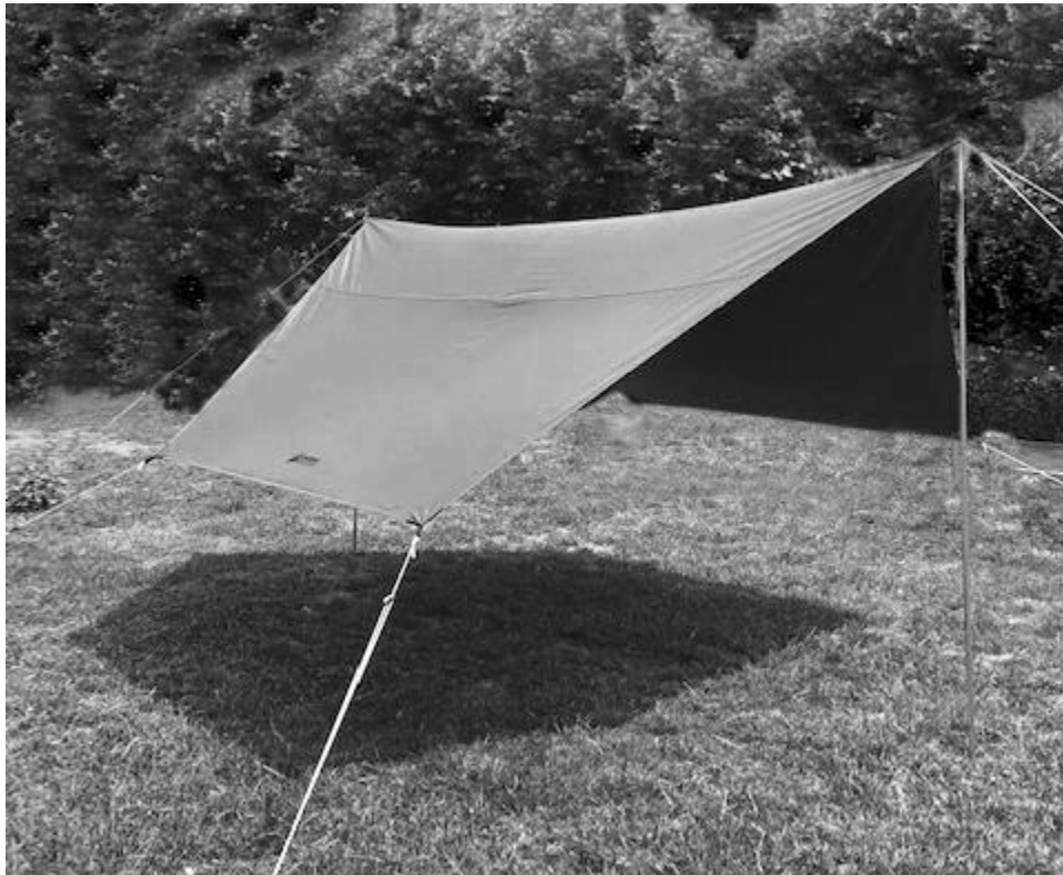
Super-6™ 15 ft Canvas Tarp with Pole Set

Visit us online at: www.KodiakCanvas.com