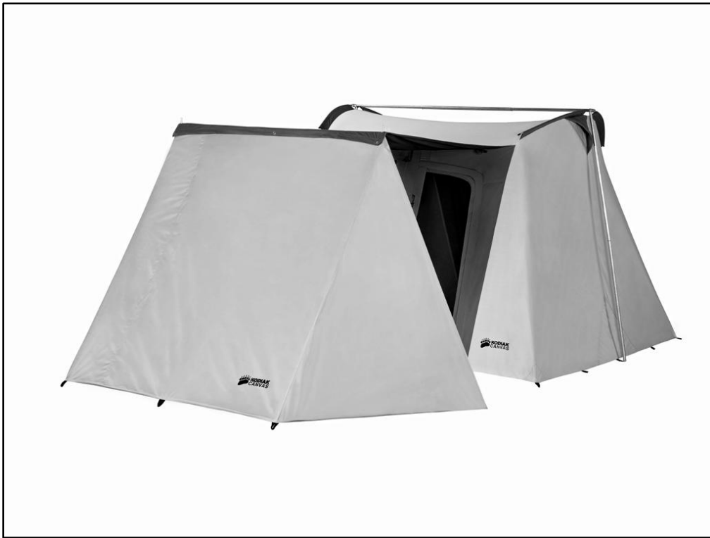
Flex-bow Tent with Wing Vestibule Accessory